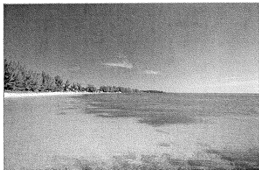
Clear ocean water near a beach on Grand Bahama Island in The Bahamas.