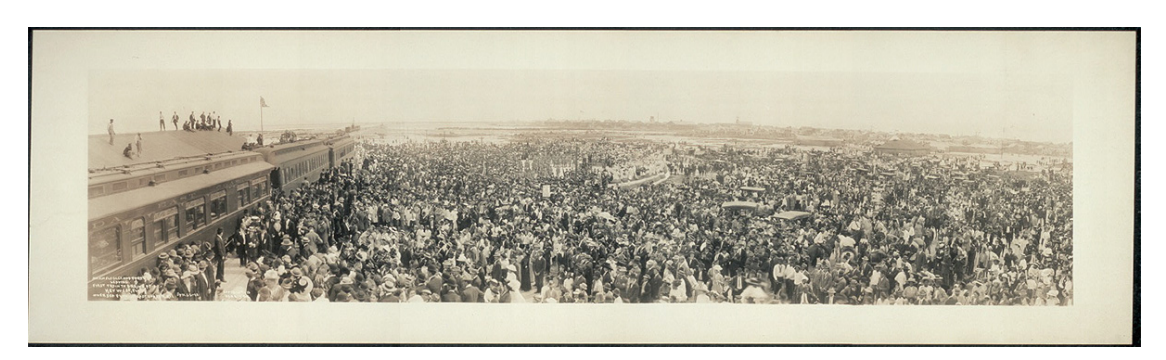
Mr. Henry M. Flagler and Party Leaving First Train to Arrive at Key West, Fla. Oversea Florida East Coast R.R.

On January 22 , 1912, the nearly twenty thousand residents of the city of Key West, Florida, located on a small island some 128 miles south of the Florida peninsula, observed the completion of an overseas rail connection to the mainland. The Florida East Coast Railway served the island until 1935, when it was destroyed by a hurricane. It was replaced in 1938 by the Overseas Highway, built on the foundation of the old railroad bed. This system of forty-two bridges, which connects the Florida Keys to the mainland, is one of the longest over-water roads in the world.